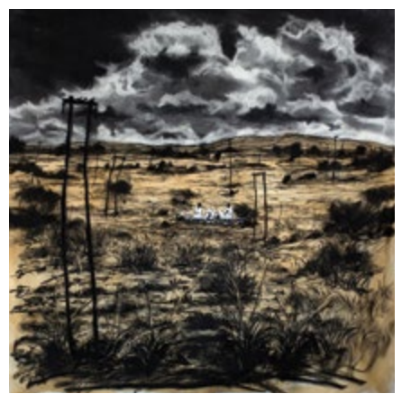
Holy Land, Themba Khumalo, 2016